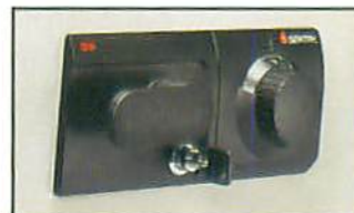
1236 Combination and Tubular Key Lock