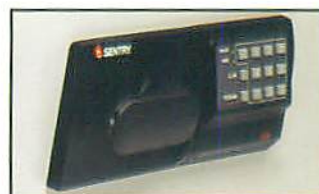
1635 5-Digit Programmable Electronic Lock