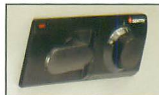
1235 Combination Lock