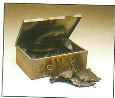
Fire destroys contents of a "fire-retardant" metal box.