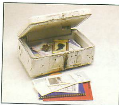
Contents of the Sentry Fire-Safe product survive fire unharmed.